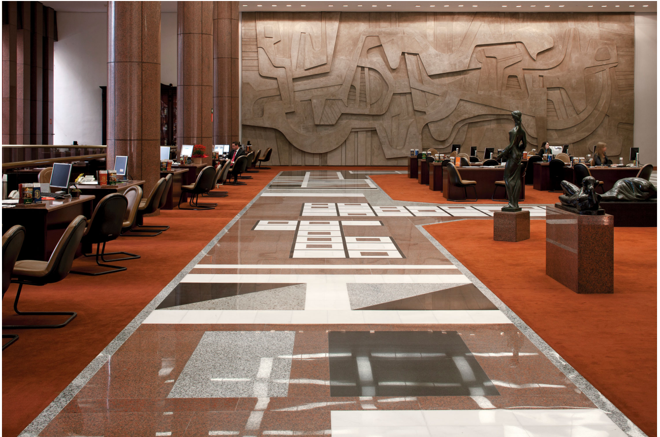
ROBERTO BURLE MARX, INTERIOR WALL, BANCO SAFRA HEADQUARTERS, SÃO PAULO, 1983.

Burle Marx always started with a canvas. His gouache technique coded each type of vegetation. These paintings are now nearly as notable as the gardens they planned. The Gustavo Capanema Palace, known to Brazilians as the Ministry of Education and Health, was the beginning of Burle Marx's revolution. It was 1938 and the world would be forever indebted to the man who changed landscape design. He had found a new form of national pride.