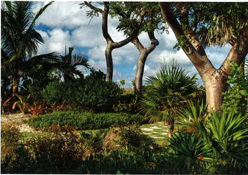
The Jungles look Each garden at the Baker's Bay home showcases mostly native plantings to complement the spectacular beachside setting.

Another garden, the more substantial pool garden, is sited between the main house and guesthouse. Both gardens showcase mostly native plants with quirky names like Jamaican Caper, Pigeon Plum, Bay Rum and Blanket Flower. Others are more familiar plants, such as sea lavender, spider lily and agave.