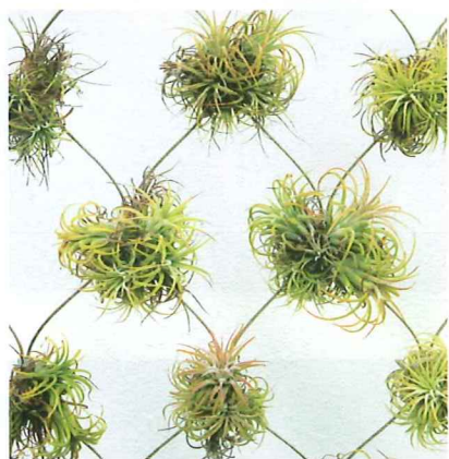
Top: Chaises longues near the pool are by Henry Hall Designs. A "botanical installation" by Jennifer Davit includes three species of Tillandsia growing on a stainless-steel screen. Above: Also known as air plants, tillandsias have stiff, narrow leaves that absorb water. Right: A trio of plantings in powder-coated aluminum containers creates a sculptural effect near the garden's entrance. Opposite: The pool surround and decking are made of ipè. A planter features Bulbine frutescens and a small tree, spiny black olive ( Bucida spinosa ).

On an 18-foot wall next to the main entrance to the garden, Madagascar jasmine ( Stephanotis floribunda ) rambles along a stainless-steel cable grid. Its waxy white flowers exude an intense fragrance similar to true jasmine ( Jasminum officinale ), although they are unrelated. It's one example of how Jungles deftly melds architectural and natural elements, often considered his signature as a landscape architect. In the center of this wall, a vertical garden designed by Jennifer Davit using a 6-foot-square, stainless-steel-mesh screen features three different species of Tillandsia ( T. concolor , T. bulbosa and T. ionantha ). Also known as air plants, tillandsias absorb water through the tiny hairlike trichomes covering their